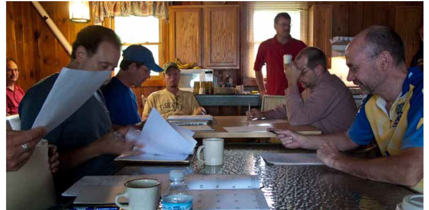
Board Meeting. Just one of the scheduled events at the yearly Retreat.

fabulous showcase to view their images. On Saturday, we ate breakfast on the screen porch overlooking the lake. Then we planned chapter events while sitting under a canopy of tree shade in front of the cabins. A few well deserving members received the chapter's unique volunteer award and then, while some packed their bags and headed home, others sat back and looked forward to staying on another night and enjoying this beautiful Midwest park.