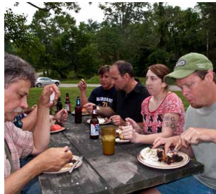
Ice cream, good food and great company.....what more could one ask for at the 2009 Ohio Valley Retreat.