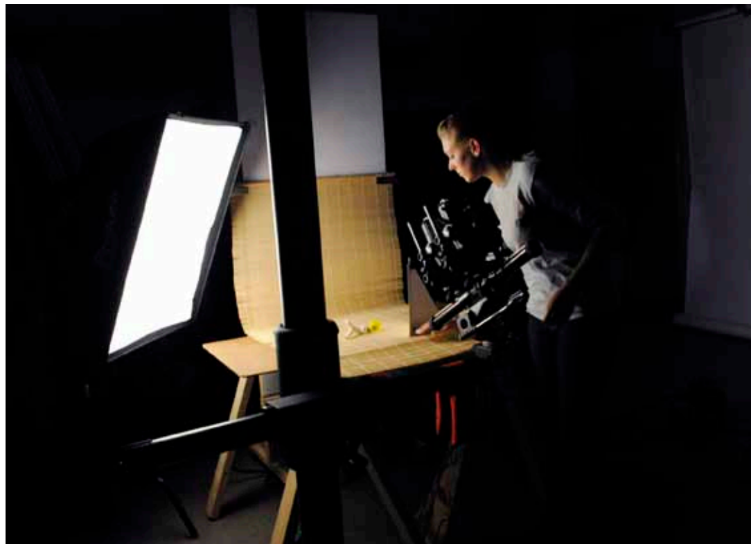
All VisCom students learn digital photography from their first term on campus which incorporates video and audio elements.

I have witnessed both positive and negative aspects of students using digital cameras. Clearly digital photography has more positive educational effects than negative. The supply costs for each class has greatly been reduced. As an example for the view camera classes the students no longer have to purchase a long list of equipment accessories and supplies that normally total over $600.00. This was one of the most expensive classes in our curriculum. Today, those same students have a dedicated supply list of less than $75.00.