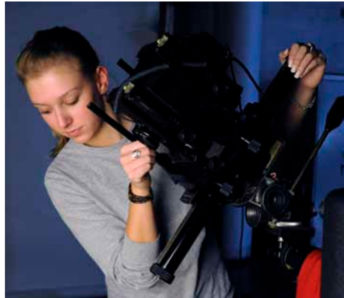
Ohio University Student working with large format camera in VisCom studio.

The Internet is a great resource for students. Newer search engines such as Google allow students to quickly research a photographer or style of photography. We encourage students to augment their internet research with hands-on education at Ohio University's Alden library. Our library has a tremendous photography book collection. Unless a report assignment specifically requires citing books as a resource, most students seldom use the library resource. I now incorporate library resource assignments in first and second years that require trips to the library and resource photographer's monolith books. As a professionally directed program, VisCom incorporates needed business knowledge for the small business owner, we have done this within our class structure for many years. Our students often have to estimate and/or invoice the faculty for their assignments.