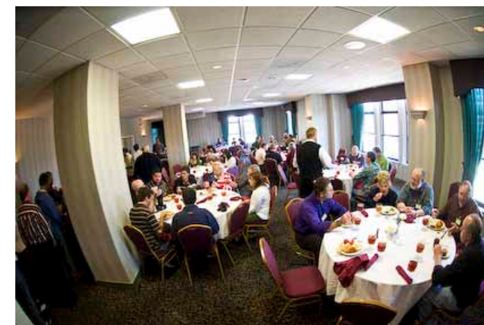
Everyone enjoyed good food and companionship.