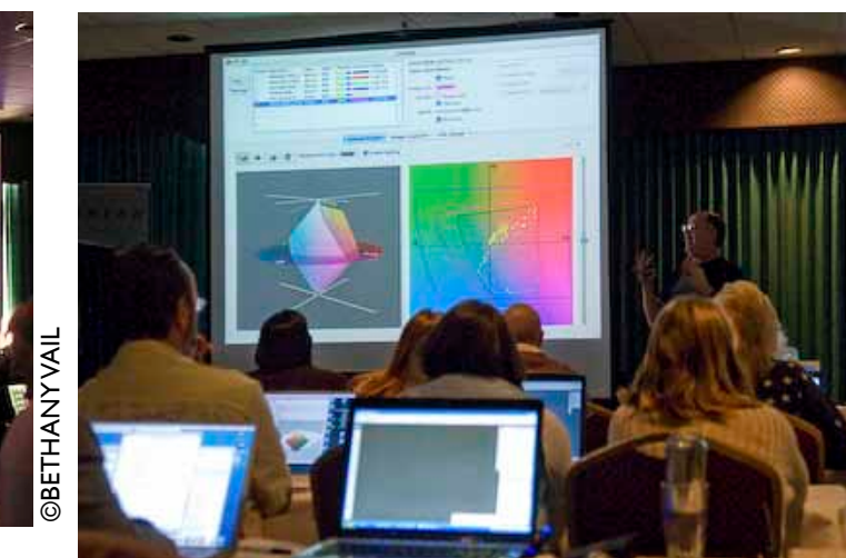
Color Balance is important to all photographers.