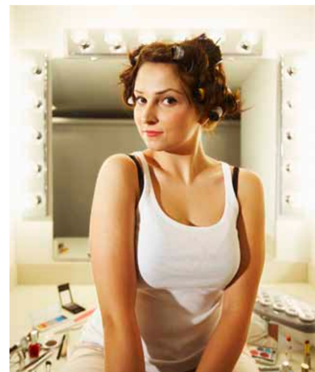
FILM BUG STRIP KIM DM SIMMONS