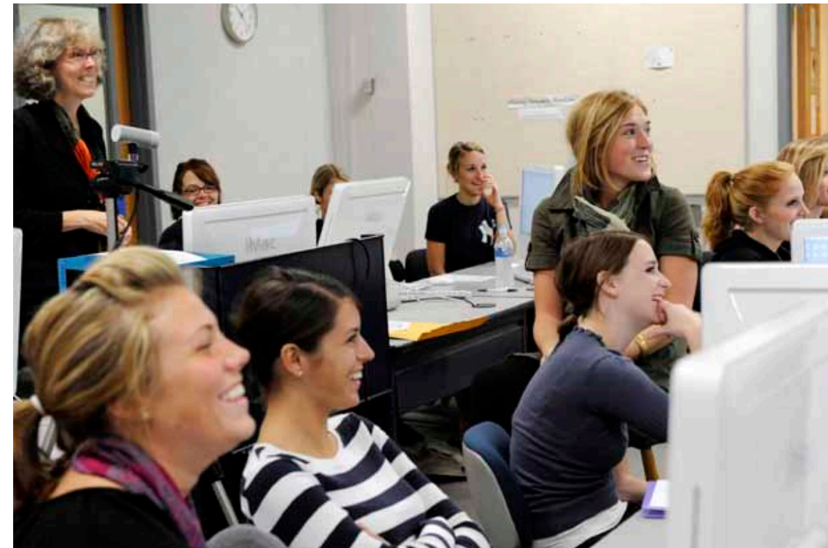
VisCom students enjoy classes which stress effective image communication concept using in their disciplines and learn how to apply new technology as it changes.

of their discipline and learn how to apply new technology as it changes during their academic and professional career. We have converted all view camera related classes to digital using the Leaf digital backs tethered and using Leaf's software's "live view" mode.